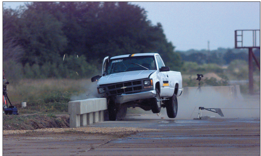
Figure 2. Impact of vehicle on Texas T202 rail reinforced with GFRP and epoxy-coated reinforcement.

The full-scale impact testing concluded that a deck-rail section using a combination of GFRP and epoxy-coated-steel reinforcement performed similarly to a section made entirely with epoxy-coated reinforcement. Although the sections containing GFRP reinforcement exhibited slightly more damage, the researchers and engineers concluded that the performance of the GFRP-reinforced and epoxy-coated-reinforced samples was sufficient to perform full-scale crash testing. Full-scale crash testing conducted in this study and in companion