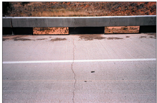
Figure 4. Crack on GFRP-epoxy-coated-reinforced section (crack has been marked).