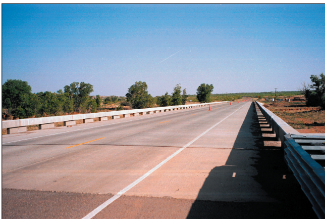
Figure 3. New Sierrita de la Cruz Bridge.

Because the Texas Department of Transportation typically uses precast, prestressed panels to construct bridge decks, GFRP bars could likely be used under these conditions. However, the use of GFRP bars in full-depth, cast-in-place concrete decks should proceed only if the key performance parameters can be enhanced.