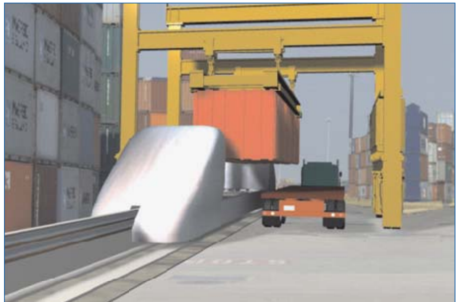
Figure 1. Container Transfer from Freight Shuttle to Truck.

Positive net social benefits of this initial concept were shown to be possible, but the risks