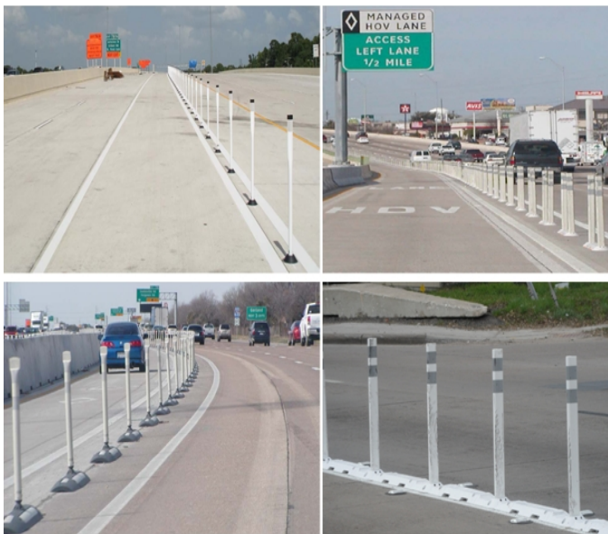
Figure 1. Examples of Pylon Devices.

Researchers then devised and performed controlled experiments testing a motorist's ability to maneuver between pylons while driving at various speeds and various spacing distances between pylons. Researchers took the information learned from the different tasks and compiled guidance on best practices of pylon implementation and maintenance.