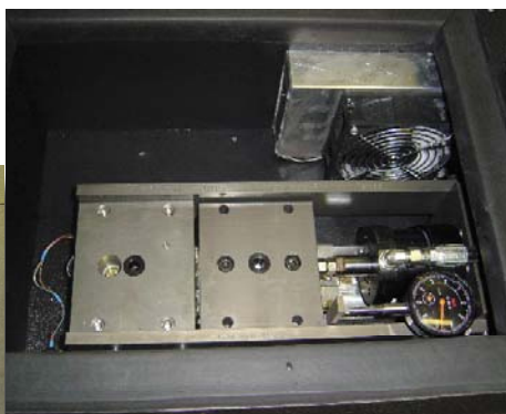
Overlay Tester-based Crack Sealant Adhesion Tester.