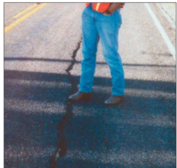
Figure 2. Longitudinal Cracking Problems.