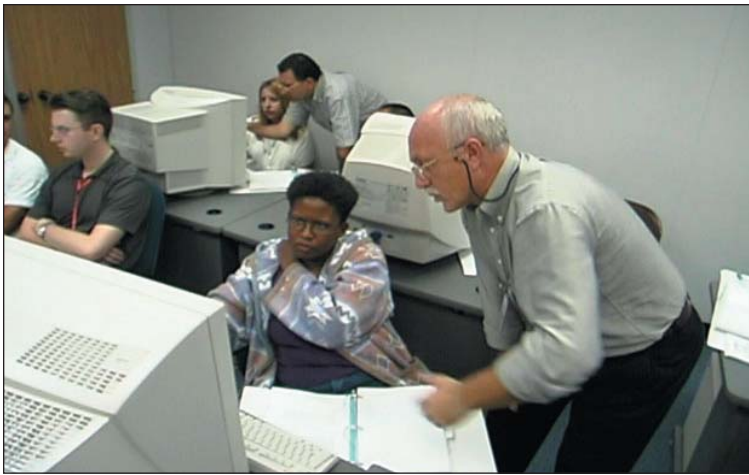
Figure 4. TxDOT Employees Attending the Pavement Rehabilitation Training Course.

district. The students are introduced to the NDT interpretation software and then provided with raw data from their projects. The 2004 schools were recently taught in the Bryan and Lufkin Districts.