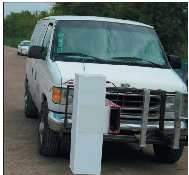
Figure 3. TxDOT's Current GPR System.

The pavement rehabilitation schools have been taught in eight district offices around Texas (Figure 4). In each case both FWD and GPR data are collected on rehabilitation projects in the host