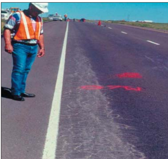
Figure 1. Distressed Flexible Pavement.

To determine the most probable cause, Project 0-1712 recommended the extensive use of two nondestructive testing (NDT) technologies, ground penetrating radar (GPR) and deflection testing with a falling weight deflectometer (FWD). GPR is used to compute layer thicknesses, locate subsurface defects, and identify changes in pavement structure. GPR is excellent for locating subsurface density or moisture-related problems. Experience in this project has shown that by combining visual distress information with both GPR and FWD information, it is usually