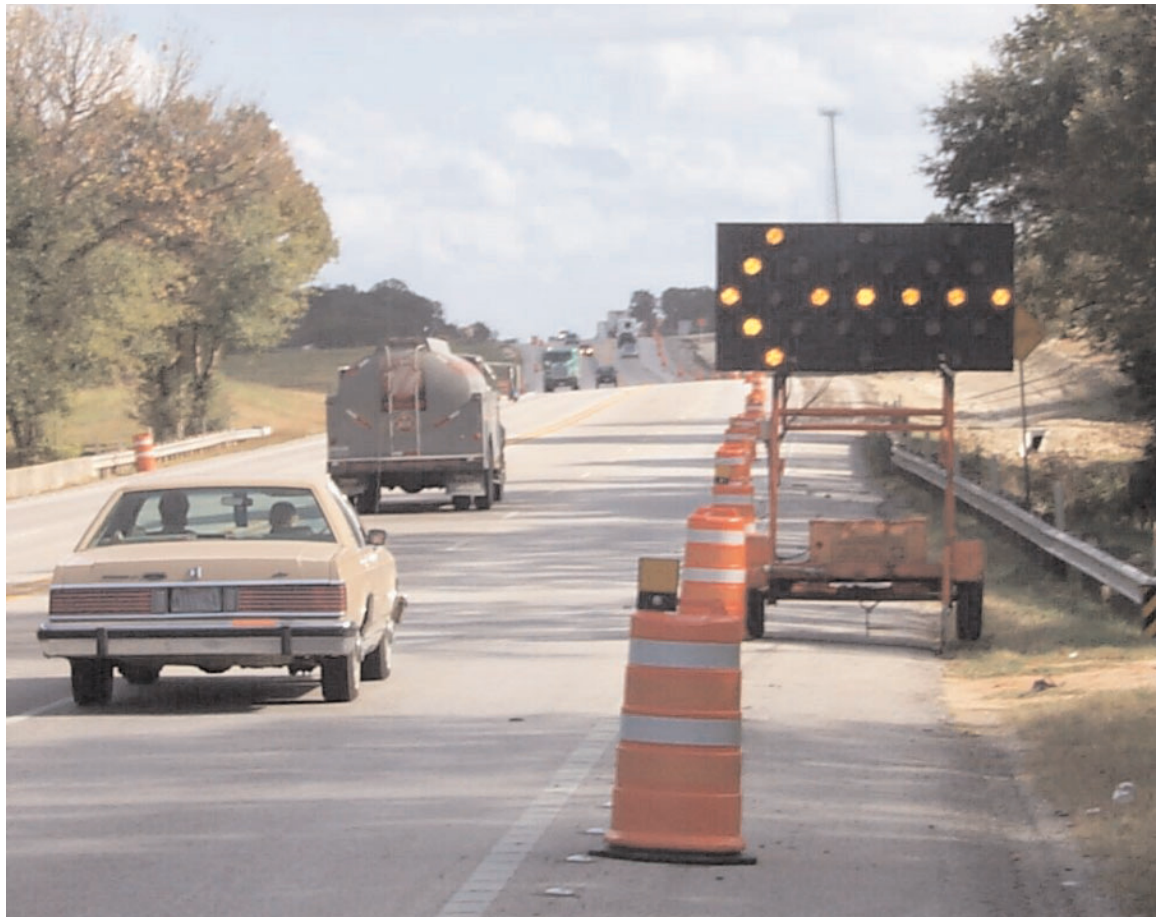
Figure 1. Type C arrow panel

metric properties of Type C arrow panels (Figure 1) and portable changeable message signs (Figure 2). The intent of the test method is to provide TxDOT with measurable criteria for qualifying arrow panels and changeable message signs for purchase by TxDOT.