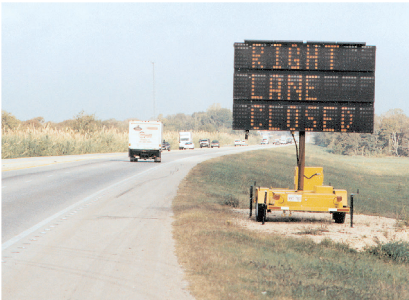
Figure 2. Portable changeable message sign