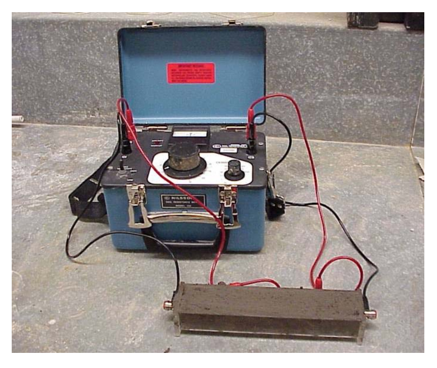
Figure 1. Nilson Resistivity Meter and Soil Box for Determination of Soil Resistivity

specific alternative water source? If so, what permit process should be followed? (b) Is there potential adverse effect on the health and safety of the public or the workers? (c) Is there potential for environmental damage from the use of alternative water? (d) How would the water composition impact material properties and performance of the constructed facility?