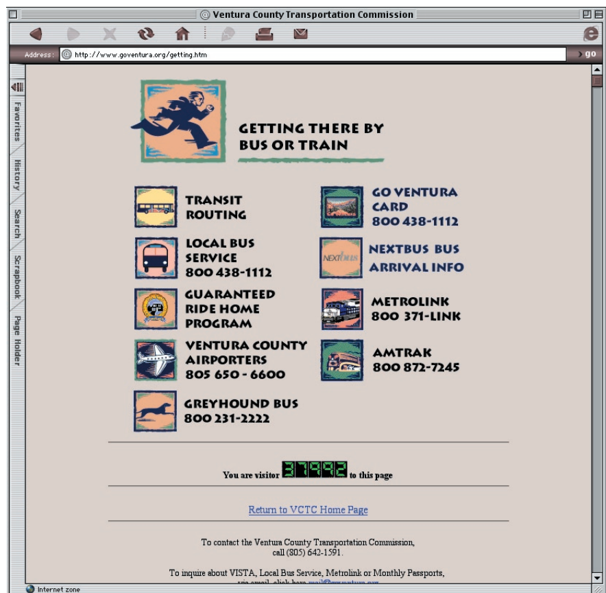
Figure 2. GoVentura's "Getting There by Bus or Train" directory page