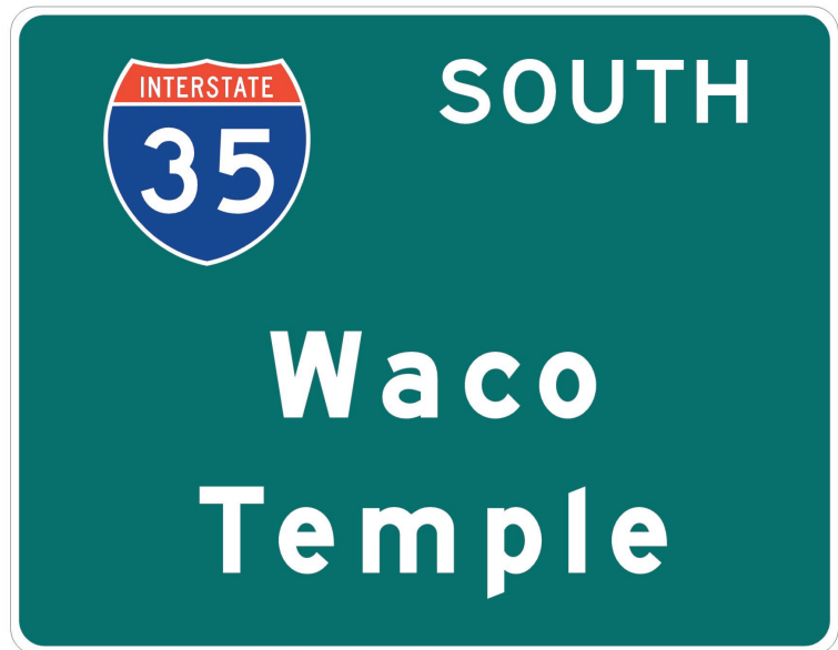
Figure 1. Series E(Modified) Alphabet

The original generation of freeway sign legend used button copy letters, in which retroreflector buttons were placed in an aluminum letter. Most modern legends are cut-out letters, in which the letters are cut directly from retroreflective sheeting. When these fully retroreflective letters are combined with the use of brighter sheetings (particularly,