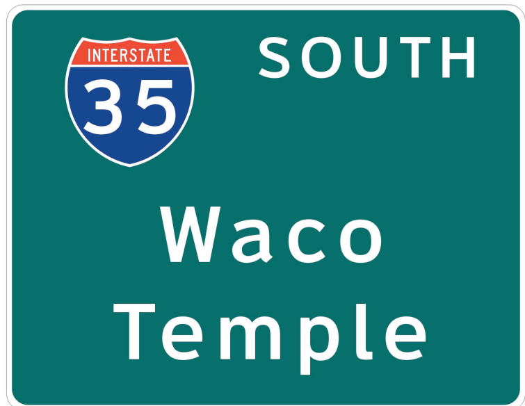
Figure 2. Clearview Alphabet