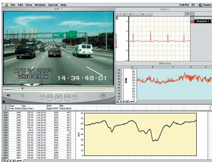
Figure 1. Examining Driver Physiology as a Means of Assessing Work Zone Complexity.