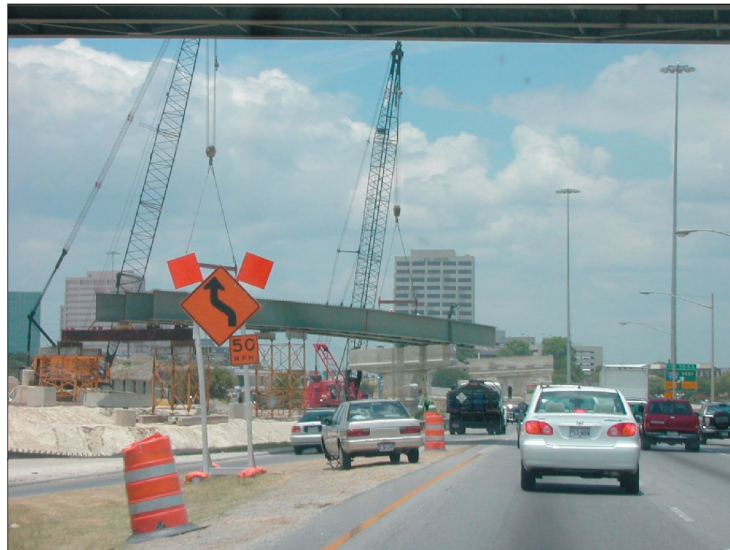
Motorists must process guidance information from numerous sources when traveling through complex work zones

Little guidance exists as to how best to coordinate and integrate all of the devices required for each of these activity areas into an effective overall work zone traffic control plan. Researchers at the Texas Transportation Institute (TTI) and at the Center for Transportation