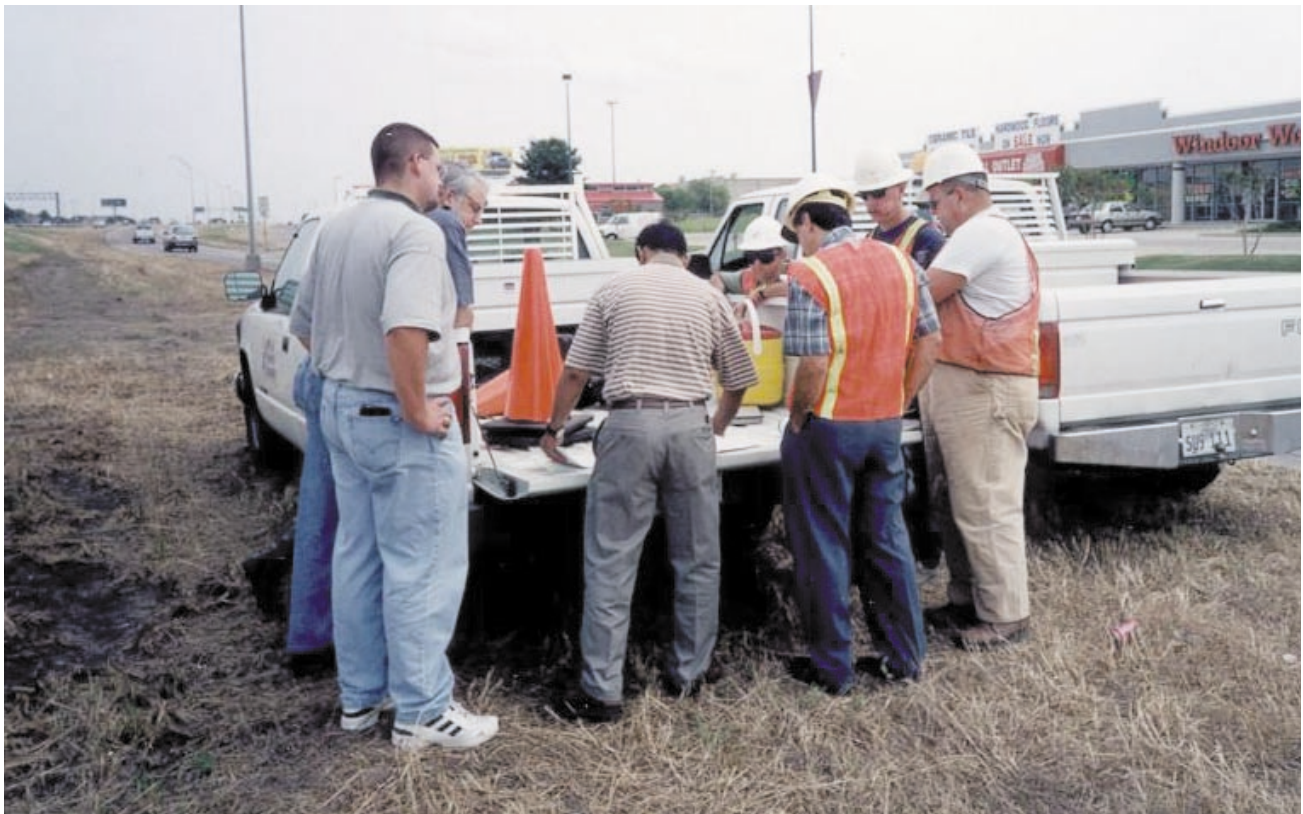
Figure 2. TTI, TxDOT, and contractor personnel discussing detector design in the field