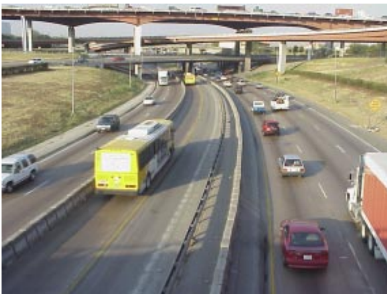
Figure 1. Barrier-separated contraflow lane

While an extensive system of permanent HOV lanes is planned for the Dallas-Fort Worth urbanized area, the Texas Department of Transportation (TxDOT) and Dallas Area Rapid Transit (DART) continue to pursue short-term or interim HOV lane projects that enhance public transportation and overall mobility. There are currently 35.4 miles of interim HOV lanes operational in the Dallas area, including a barrier-separated contraflow lane on I-30 (East R.L. Thornton Freeway [Figure 1]) and buffer-separated concurrent flow HOV lanes on I-35E North (Stemmons Freeway) and I-635 (Lyndon B. Johnson Freeway [Figure 2]).