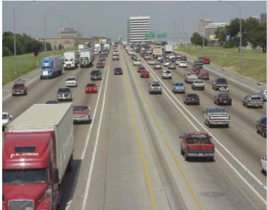
Figure 2. Buffer-separated concurrent flow lanes

The operational performance of the HOV lanes was measured in terms of vehicle and person volumes, occupancy rates, transit impacts, cost-effectiveness, enforcement, safety, and public acceptance. Operational data was collected several times per year so that changes can be identified and documented. The evaluation included a “before” and “after” HOV lane comparison, as well as comparisons with a control corridor that does not have an HOV lane, I-35E South (South R.L. Thornton Freeway).