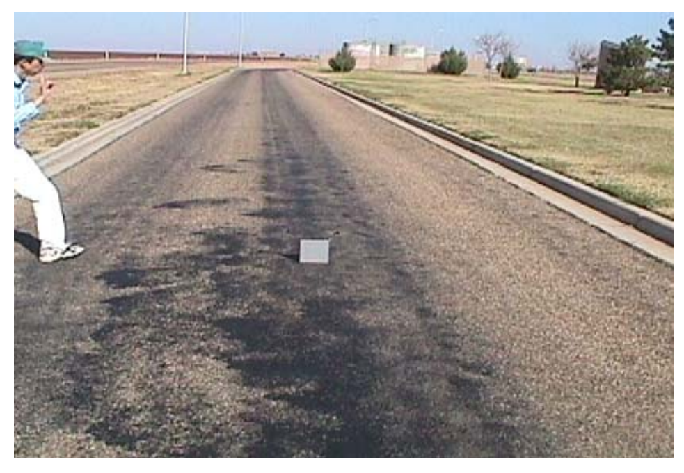
Daytime View of Target

During a visit by Dr. Adrian to the Abernathy test site, it was noticed that the reflectance qualities of a small section of pavement varied laterally across the width of the pavement. This is due to the effect that traffic has on the pavement's surface in the wheel paths. STV classifies pavement reflectance into only four categories and about 80% of pavements fall into a single category. Since background luminance is driven by pavement reflectance, this finding is significant. The researchers expanded on data taken by Adrian on over 100 pavement samples taken in Canada using Adrian's photogoneometer. Data was also taken in Texas. The final analysis showed that the impact of traffic in the wheel paths is significant in asphaltic pavements and that both brightness and specularity increase over time. This invalidates an STV assumption that the pavement surface is both uniform in tex-