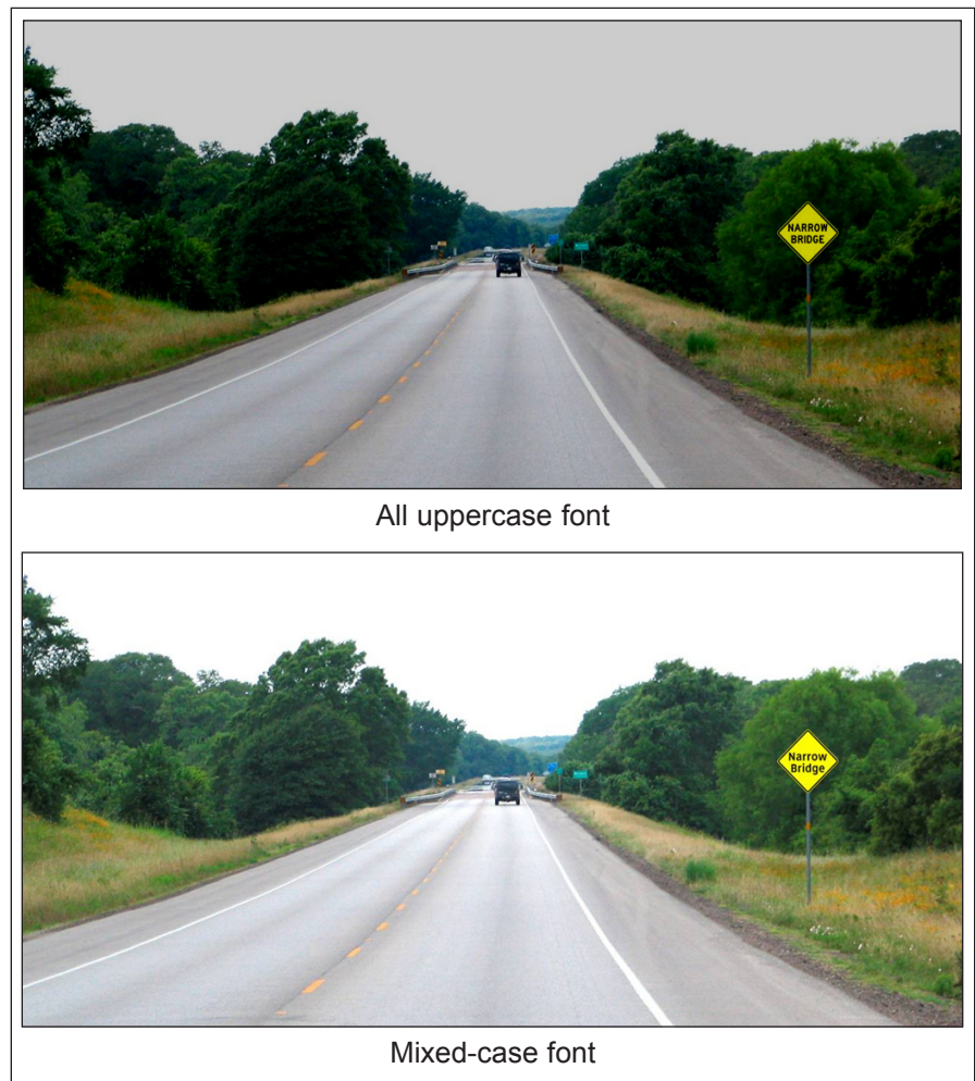
Figure 3. Presentation Images Displaying Each Sign Font.

the letter height, line spacing, or letter spacing. Subjects were shown each image and asked to identify the legend on the sign. The signs were displayed for one second.