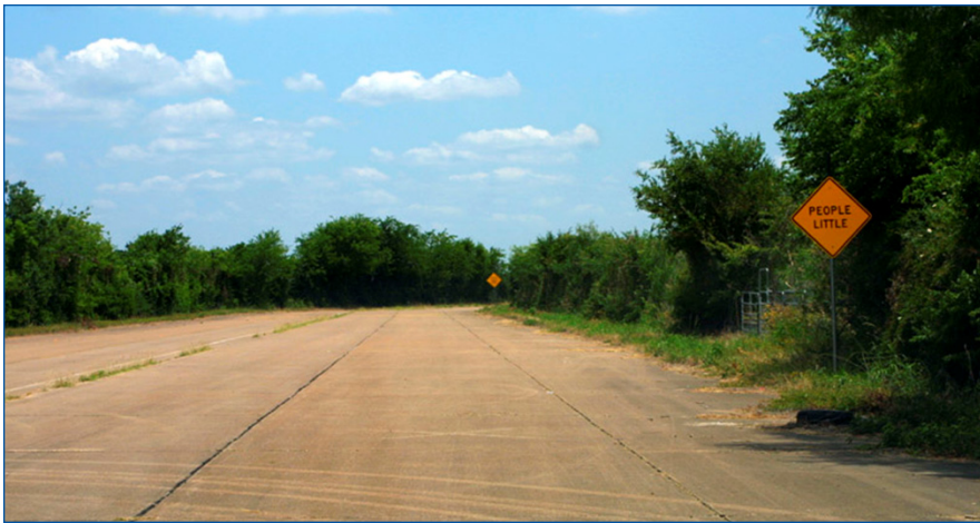
Figure 4. Legibility Task Course and Signs in Daytime.

the bottom of the sign and offset approximately 18 feet from the driving lane. The signs used in the evaluation displayed two-line and three-line legends.