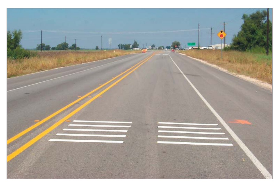
Figure 1. Typical Installation of TRSs.

The limited time associated with the research project prevented formal safety analyses of field installations. Instead, traffic operational studies were used to evaluate the effectiveness of the rumble strips. Informal monitoring of the study sites revealed no immediate concerns, but more time is needed to fully understand the safety impacts of these rumble strip applications.