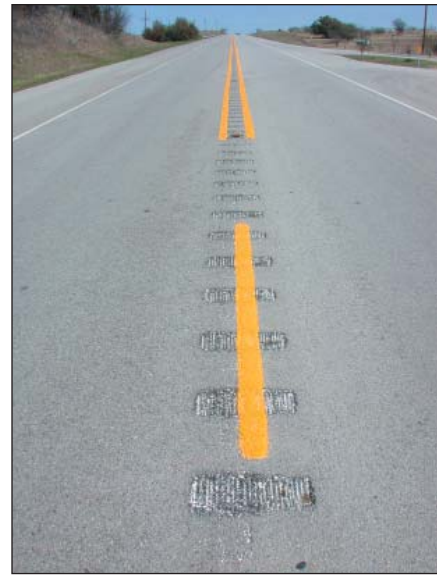
Figure 2. Typical Installation of CRSs.

The researchers found that the installation of TRSs produced small