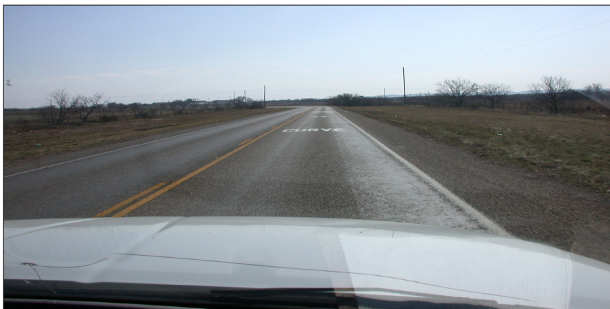
Figure 3. CURVE 55 MPH Treatment.

In summary, treatments that provide a clear message to drivers as to a specific action to take showed the most positive effects in this research. Lane direction arrows clearly indicate to drivers the correct direction of travel for each lane. Speed limits applied in advance of curves inform drivers of the safe advisory speed. Horizontal signing should be used at key locations where a clear message can be transmitted. If horizontal signing is applied broadly with poor or ambiguous messages, the efficacy and safety benefit may be diminished.