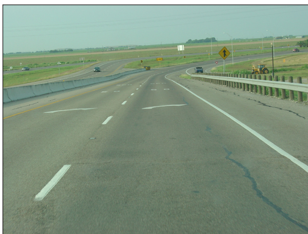
Figure 4. Curve Arrow and Advisory Speed Treatment.