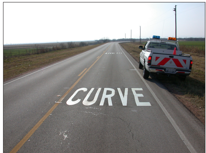
Figure 2. CURVE AHEAD Treatment.