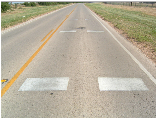
Figure 1. Transverse Line Treatment.

The project showed substantial reductions in speed for the multi-lane freeway location marked with a curve arrow and an advisory speed, while the rural curve marked with the word CURVE and the advisory speed showed modest reductions in speed. Both treatments that included a specific advisory speed produced clearer results than the treatments that simply warned