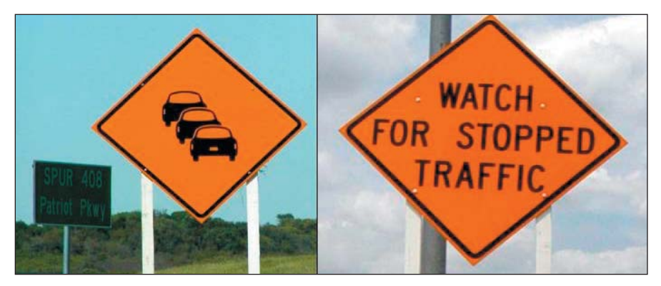
Figure 2. Congestion Warning Signs Used in Field Tests.