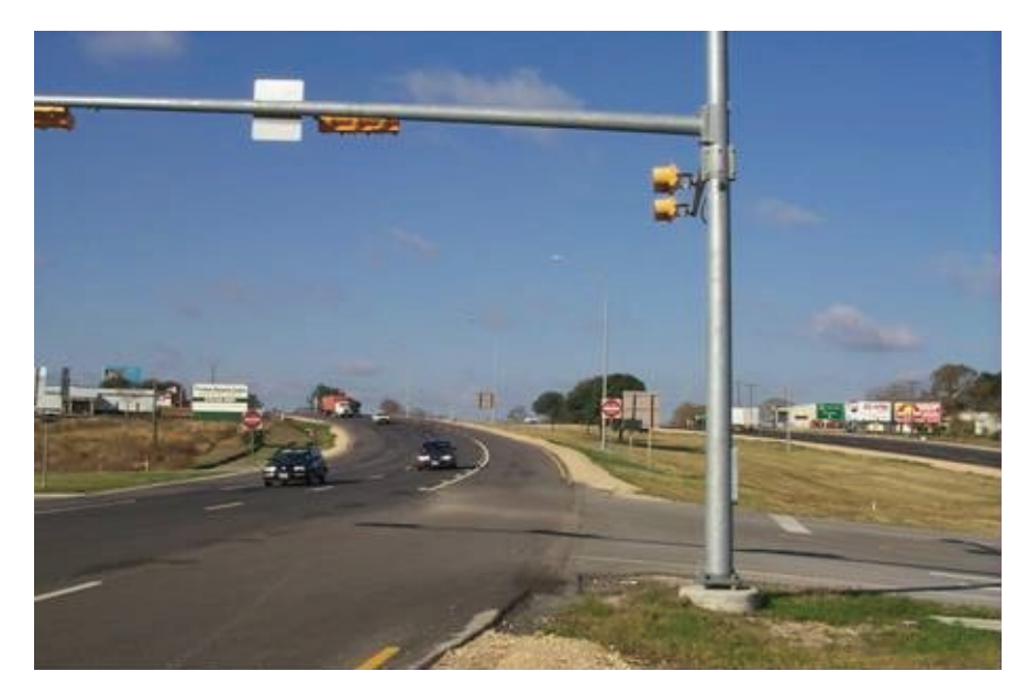
Figure 3. Eastbound US 290 Approach at Brenham before AWEGS.

The AWEGS reduced red-lightrunning during the targeted first five seconds of the red phase by 40-45 percent on a daily basis. Figure 5 presents summary findings of the before-after study. The Level 2 system, which was found to have the same red-lightrunning rate per phase termination as the less operationally efficient Level 1, is much preferred because it also minimizes any negative impact on the operation of the existing traffic actuated controller (from phase holds), and it provides new and effective dilemma zone protection for targeted trucks and very high-speed cars.