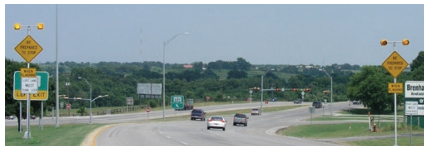
Figure 4. Eastbound US 290 Approach at Brenham after AWEGS Installed.