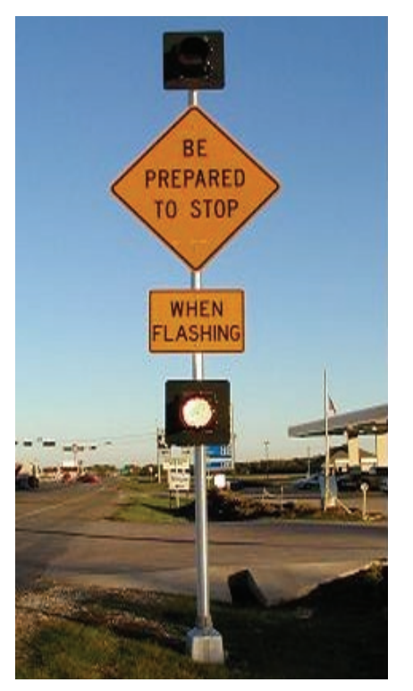
Figure 2. AWEGS Advance Traffic Control Sign (W 3-4) in Waco.

drivers approaching a signalized (traffic actuated) intersection at high speed to a speed that allows them to safely stop when the signal turns yellow and then red shortly thereafter.