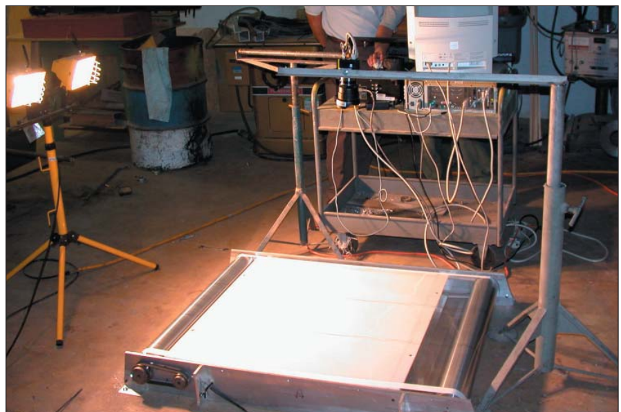
Figure 2. Testing of Prototype Crack Simulator.

quantifiable procedures for verification of calibration and evaluation. The various methods for verification were investigated and the “best” technique, a crack simulator machine that can illustrate different crack types and widths, was selected. A prototype of the proposed