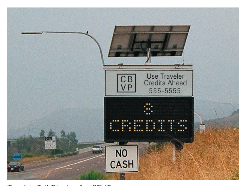
Possible Toll Display for CBVP.

Travelers would have several options on how to purchase credits from the toll authority in charge of the CBVP program (see transaction diagram). The system would operate in much the same way as a toll road with electronic toll collection except the cost of the credits would be set in a free market system (much like a stock