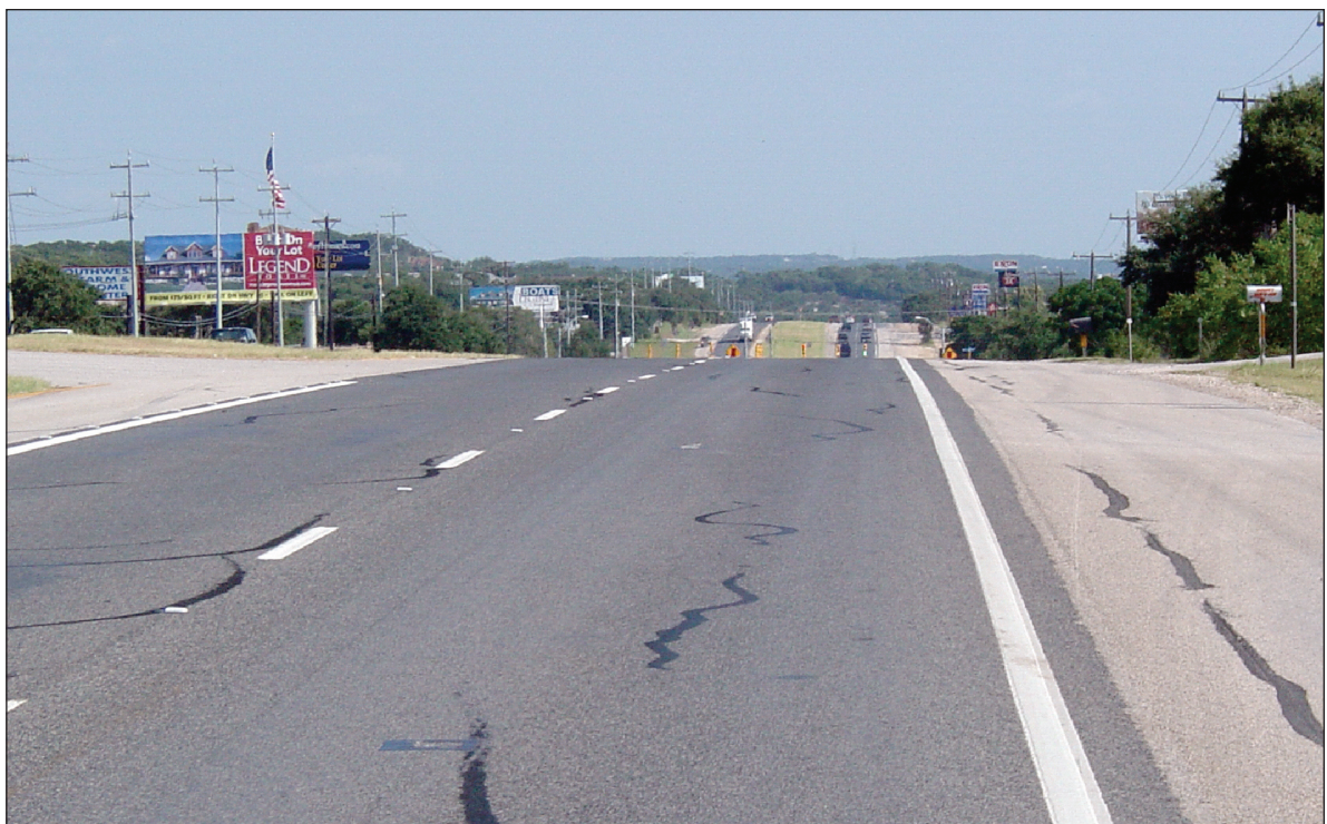
Figure 1. Signal Located on the Far Side of Vertical Curve.

65 mph) from the primary traffic control device (i.e., the traffic signal). Therefore the possibility exists that even the advanced warning sign may not be fully visible to motorists approaching the intersection because their line of sight is limited by the vertical curve upstream of the signal. Also, the queue of vehicles from the signal may extend far enough back from the signal that even an advanced warning sign would provide insufficient notice to