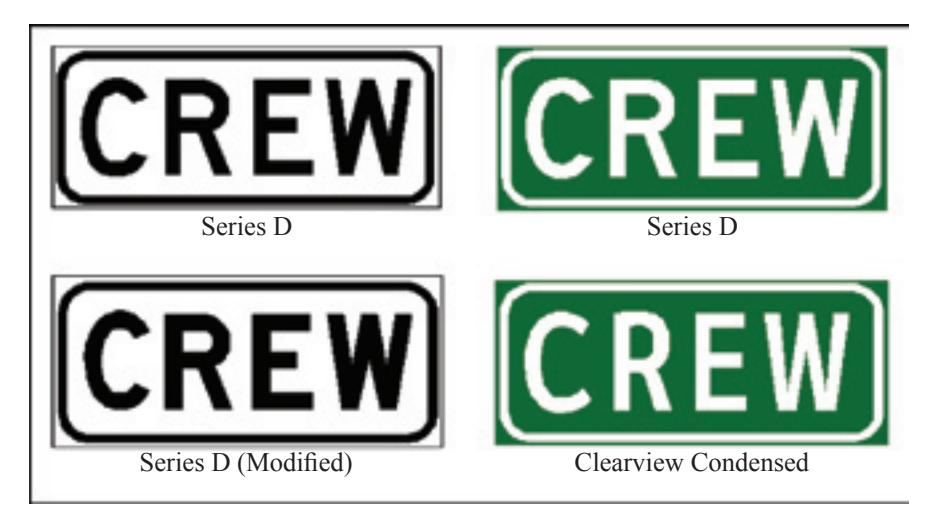
Figure 1. Signs Used in First Legibility Evaluation.

The basic objective of this research was to compare the legibility of guide signs using combinations of microprismatic and beaded sheeting. A secondary objective was to evaluate the Clearview fonts for guide signs as compared to the standard highway fonts. The research focused on destination/distance signs and shoulder-mounted guide signs but also included a small sample of Texas county road name signs. The 30 individuals that participated in the study drove an instrumented vehicle past 11 sign installations, reading the sign messages at the furthest possible distance. Researchers recorded the legibility distance and analyzed the data to assess the impacts of: retroreflective material combinations used for the legend and background, the type of legend font, and the spacing of letters.