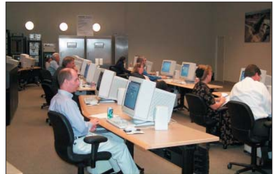
Figure 4. Professional Development Activities Conducted in TransLink® Laboratory.