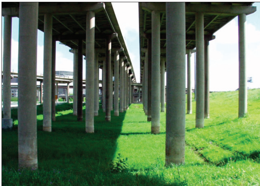
Figure 3. IH 610 at US 595, Houston, Texas.