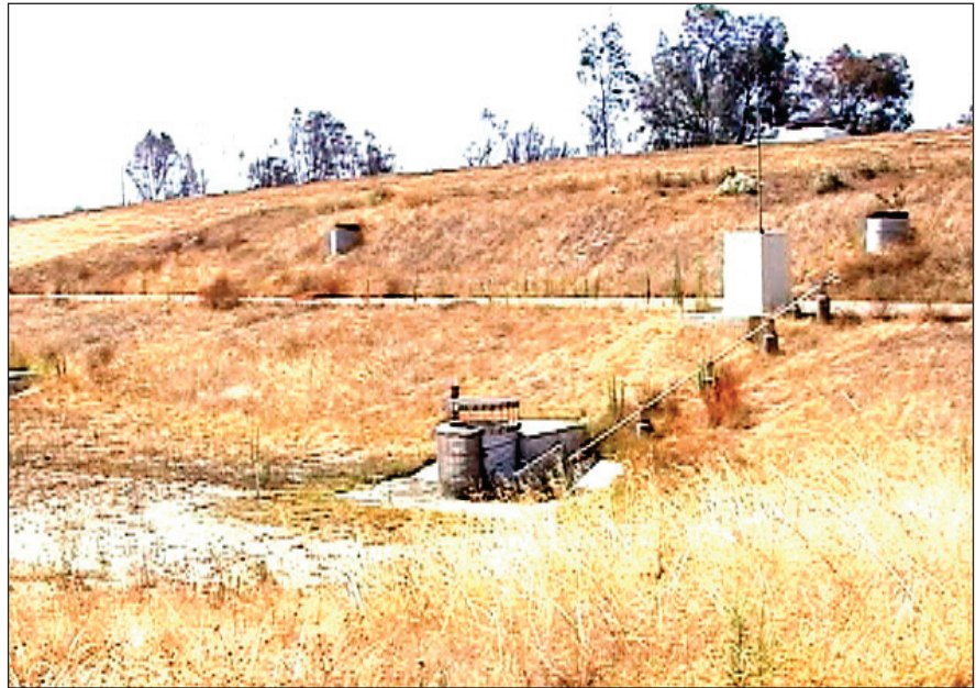
Figure 2. Detention Basin, California.

The guidance section of Report 0-4173-2 provides information on how to select the most appropriate type of BMP for various conditions. One of the current disadvantages of using all non-proprietary BMPs is that each one has to be designed for site-specific conditions. This is generally only a handicap when