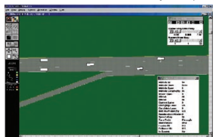
Figure 3. Example TRAF-VU Animation of CORSIM Network.

FHWA continues to improve CORSIM. Future versions should be more user friendly and should provide more reliable simulation of congested conditions. Improved versions of INTEGRATION as well as other models being developed may also provide effective and reliable simulations of congested freeways.