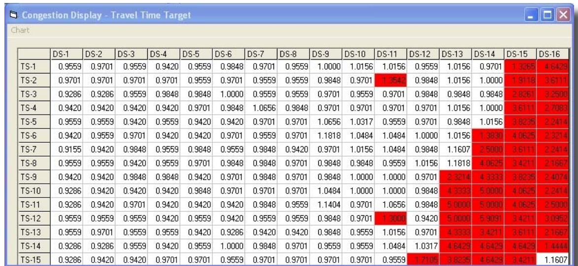
Figure 2. Example Strip Chart Output from Real-Time Performance Measurement System.

While the initial results are promising, modifications to the NTOC methodologies would be necessary for some measures, such as a straight comparison of speed or travel time. Without a comparison baseline, the normal volatility in these parameters would render them inadequate for identifying abnormal conditions. Additional efforts are necessary to determine the sensitivity of the measures to variations in traffic levels, changes in the ratio value used, etc. Additionally, a determination of the sensitivity of the travel time ratio performance measure should be made if the target travel time values change by time of day, as determined by an operator. An example of the operator interface developed for displaying the extent of congestion measure is shown in Figure 2.