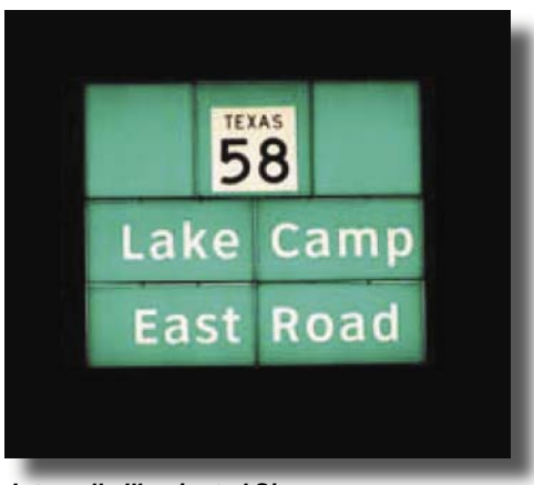
Internally Illuminated Sign