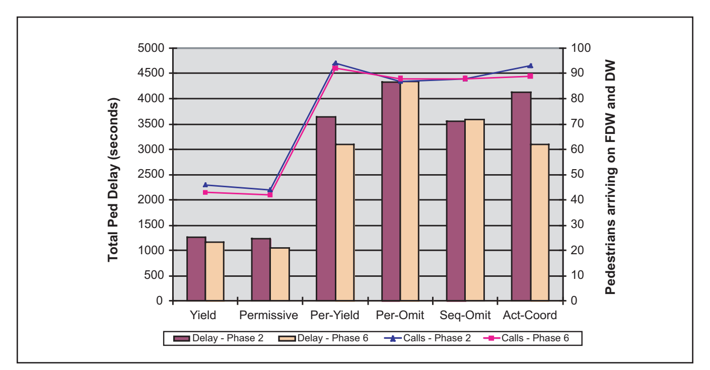
Figure 3. Coordination Modes Benefiting Pedestrian Service.

We recommend the use of Permissive Yield mode with Shortway Transition when using an Eagle controller. When using a Naztec controller, we recommend using Stop in Walk – ON, Minimum Permissive – ON, and Short/Long transition mode. Selecting the recommended settings will cause minimum disruption to intersection as well as arterial operations.