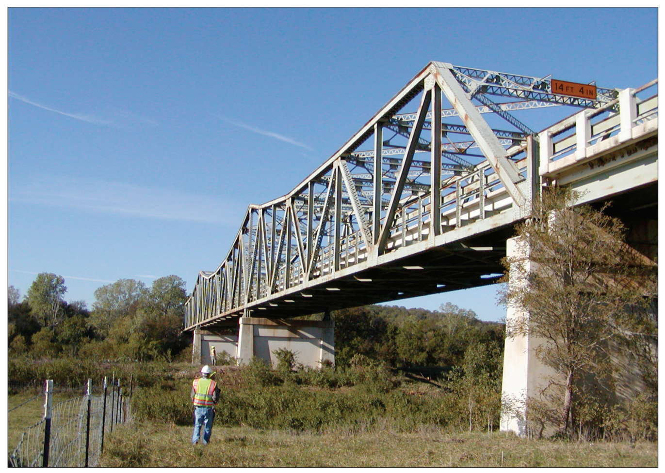
Figure 2. U.S. 281 over the Brazos River in Palo Pinto County, Texas.