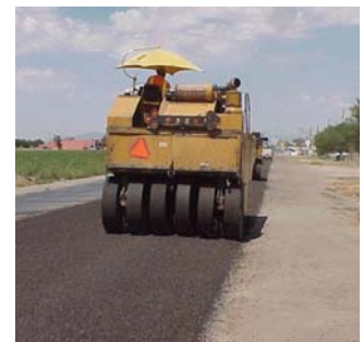
Figure 1. Seal Coat Construction