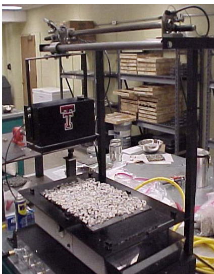
Figure 2. TechMRT Automated Seal Coat Aggregate Spreader

When samples are prepared, several experimental factors that simulate the field conditions are considered. These experimental factors varied somewhat between hot asphalt seals, emulsified asphalt seals, and seal coats that use precoated aggregates. For hot asphalt that does not use precoated aggregate, these experimental factors include the aggregate dust level (if non-precoated aggregate is used), percent embedment of aggregate in asphalt, surface tem-