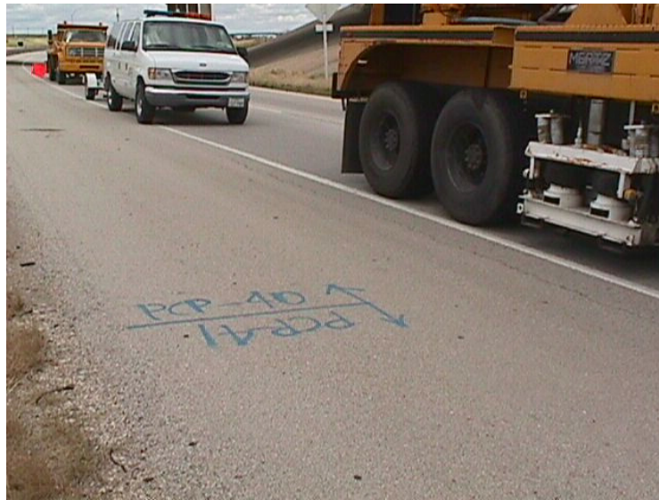
Deflection Testing Using FWD and RDD Equipment

tation (SDHPT), now the Texas Department of Transportation (TxDOT), requested that the Center for Transportation Research (CTR) of The University of Texas at Austin oversee the design and construction of two PCP experimental sections in Texas. In 1985 and due to funding constraints, only one PCP was constructed in McLennan County on IH 35 under TxDOT Research Project 9-556.