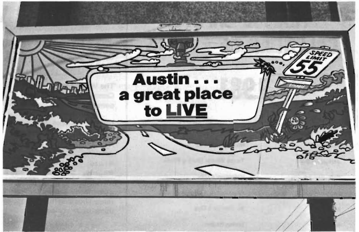
Part of the Austin Jaycees' efforts to promote 55 mph, this billboard appears within the city limits.

A. You're following at a safe distance and someone does it again. What next? Believe it or not, the answer is to back off again. If you get frustrated and start following too closely, you're only increasing your chances of a possible rear-end collision. Keep a level head. Never let emotion get the best of you.