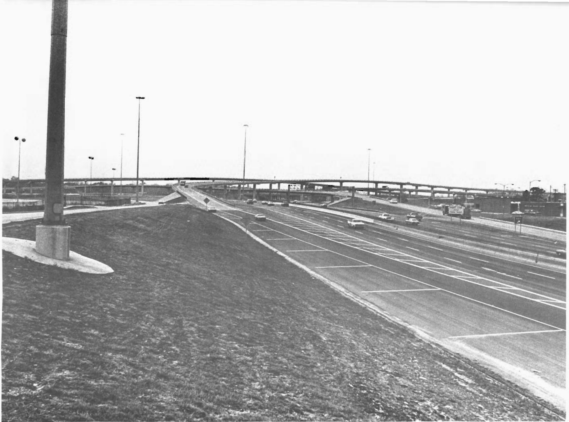
Two Side-Mounted "Z" - Pattern Lighting Standards In North Approach of IH 610 and US 59 Interchange, Houston, Texas