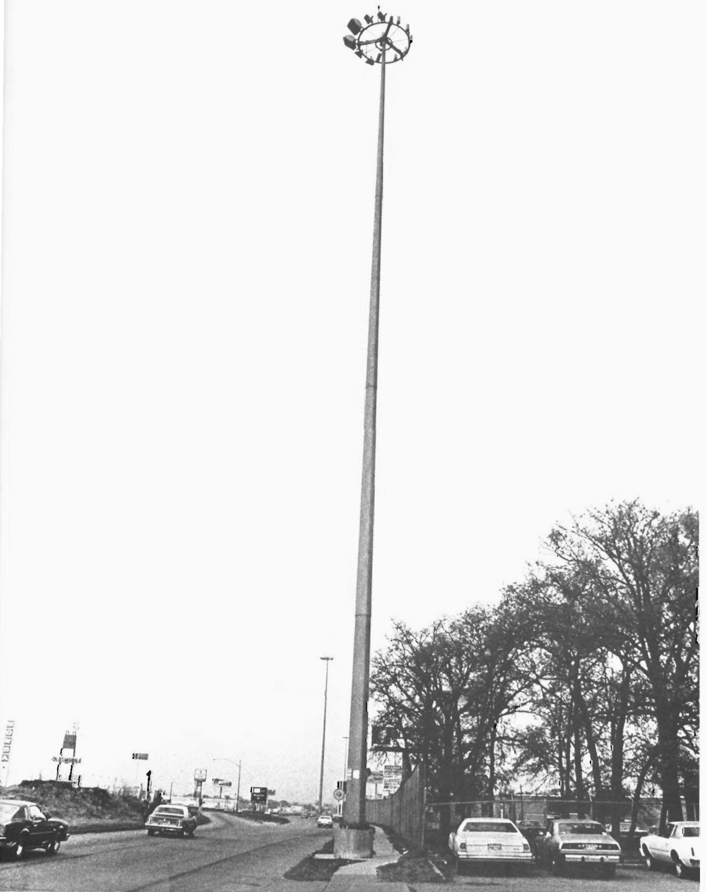
"Z" - Pattern Standard Mounted Along IH 45 Right-of-Way in Houston, Texas