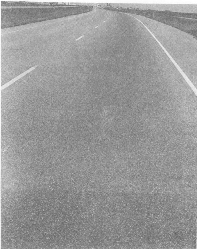
SYSTEM I - 1981 4 YEARS AFTER OVERLAY