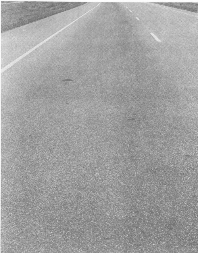
SYSTEM II - 1981 4 YEARS AFTER OVERLAY