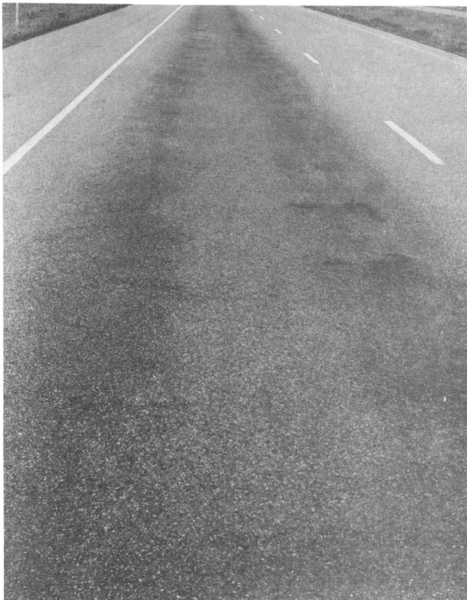
SYSTEM IV - 1981 4 YEARS AFTER OVERLAY