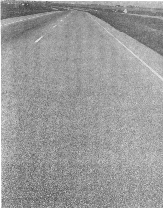
SYSTEM III - 1981 4 YEARS AFTER OVERLAY