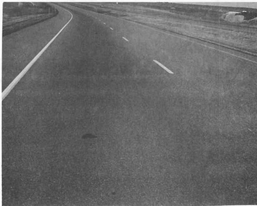
SYSTEM II - 1980 3 YEARS AFTER OVERLAY