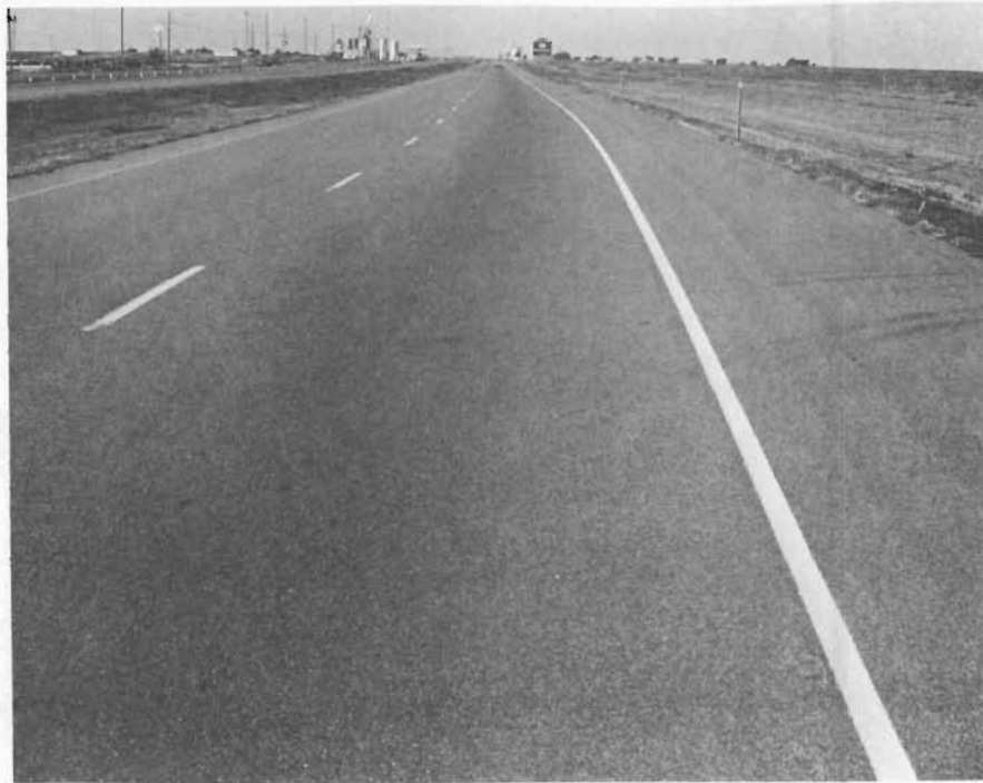
SYSTEM I - 1980 3 YEARS AFTER OVERLAY