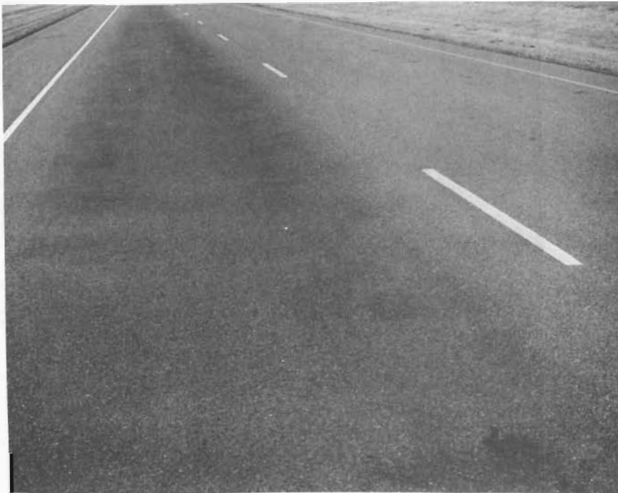
SYSTEM IV - 1980 3 YEARS AFTER OVERLAY