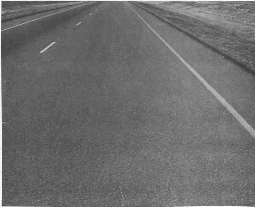
SYSTEM III - 1980 3 YEARS AFTER OVERLAY