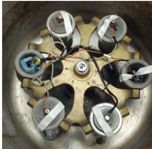
Figure 8: Assembled Testing Setup within the Centrifuge