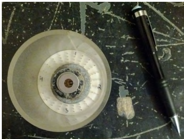
Figure 7: Assembled Permeameter Cup with Overburden Washers and Washers Simulating 51.3 Grams of Overburden from the Ponded Water