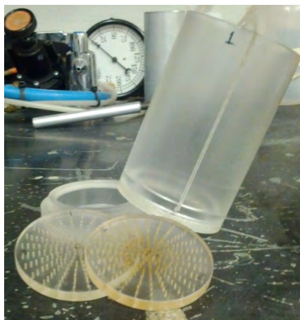
Figure 1: Components of Plastic Permeameter Cup: Top Cup, Cup Base, and Porous Disks

The top cup, cup base, and the porous disks were cleaned and air dried before each centrifuge test. These components are shown in Figure 1.