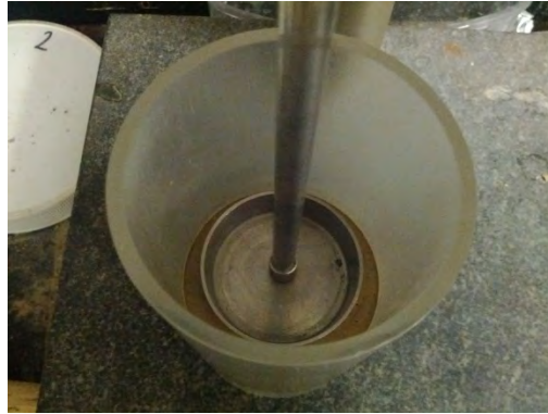
Figure 6: Measurement of Compacted Specimen Using Metal Plate and Mounted Caliper

bottom, and left sample heights, an acceptable range was +0.002'' and -0.005'' from the target height.