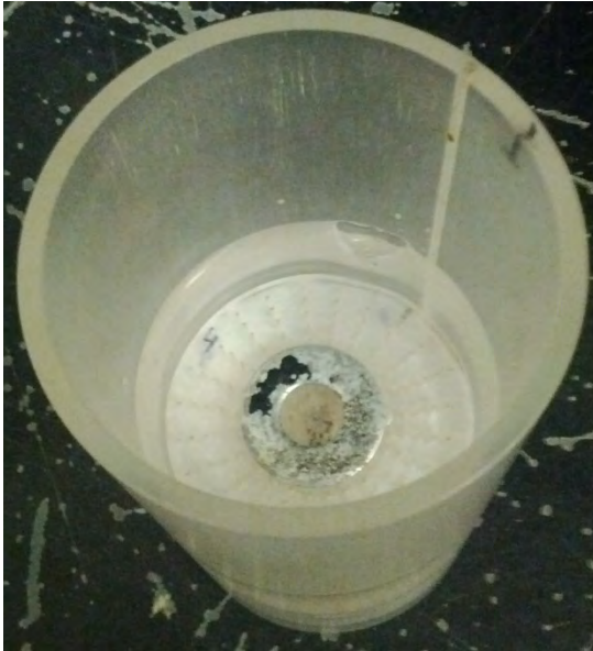
Figure 9: Final Permeameter Cup Assembly with 2 cm of Ponded Water Head and Overburden Washer