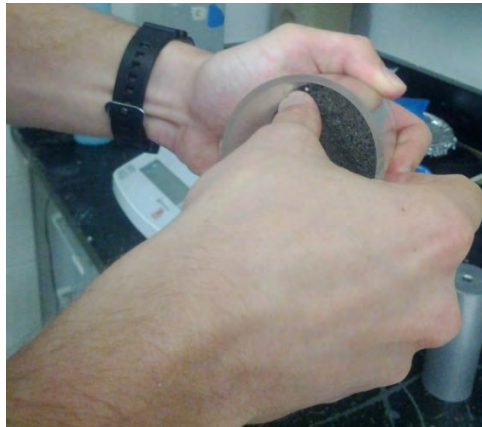
Figure 3: Densification of Soil Using Thumb