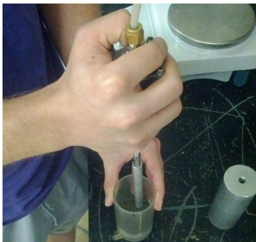
Figure 4: Compaction of Soil Specimen Using Small Diameter Kneading Compactor