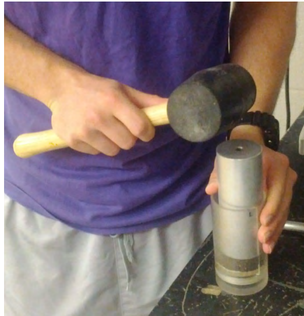
Figure 5: Compaction of Soil Specimen Using Rubber Mallet and Large Diameter Compaction Rod