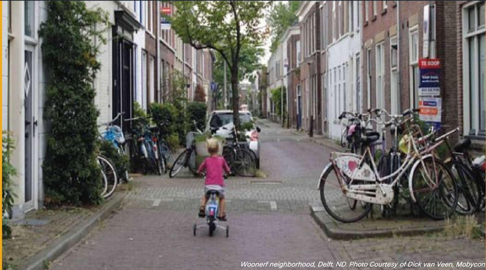
Woonerf neighborhood, Delft, ND.