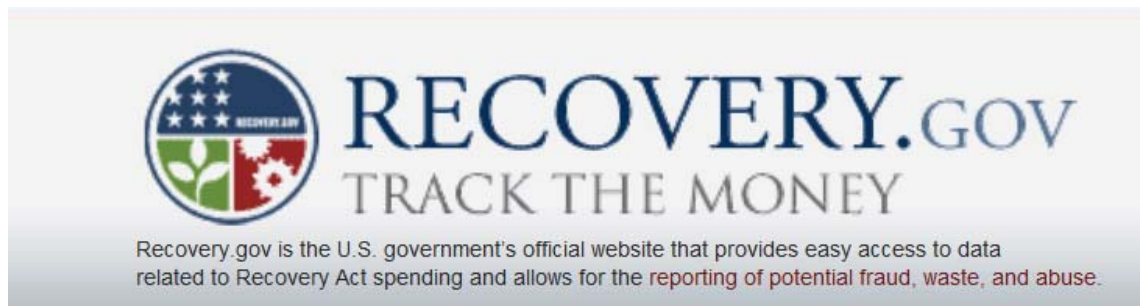
Figure 1.1: ARRA website logo

The President promised full accountability and transparency of ARRA funding and a web site ( http://www.recovery.gov/ ) was established (Figure 1.1). State agencies like TxDOT who received ARRA funds had to report, on a monthly basis, various data on each project in the ARRA program including staff numbers, hours worked, and payroll. From September 2009 to August 2010, TxDOT supported Research Project 0-6592, “Implementing ARRA Economic Impacts Database,” to explore labor usage in construction projects.