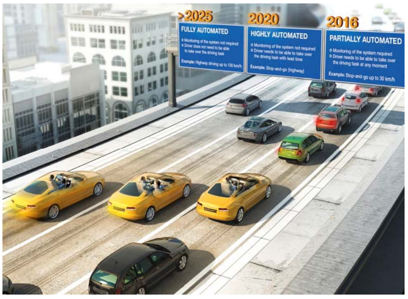
Figure 1. BMW's Autonomous Vehicle Agenda 2025 (44)