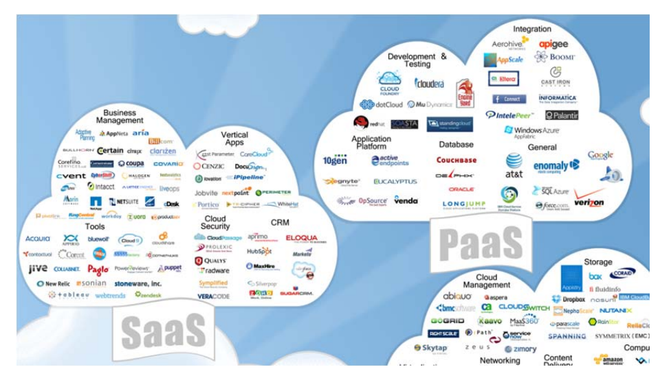
Figure 4. Cloud Service Providers [16]