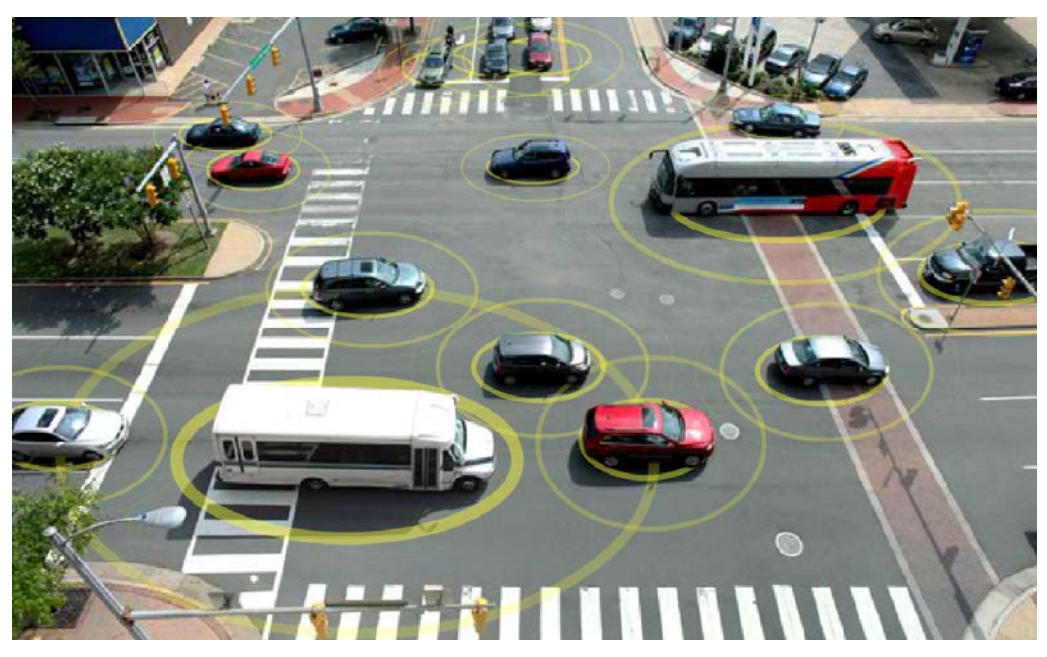
Figure 1. Connected Vehicle Safety Pilot Program (USDOT)