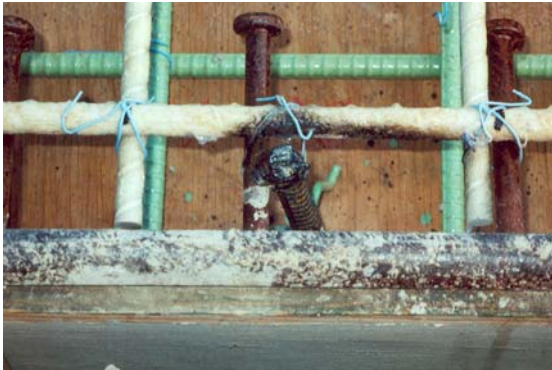
Figure 2. Burnt GFRP bar.

The surface of GFRP bars should not be damaged at any time. GFRP bars can be damaged during placement, prior to concrete placement, and during concrete placement. Because damaged surfaces can exhibit significant reductions in strength and durability of the bars, care must be taken to prevent surface damage during these times. Figure 2 shows where a GFRP bar was burnt near an area where steel was flame cut. The integrity of this bar was likely significantly reduced. Figure 3 shows workers vibrating the concrete on a deck reinforced with GFRP bars. Care must be taken to prevent surface damage to the GFRP when consolidating the concrete.