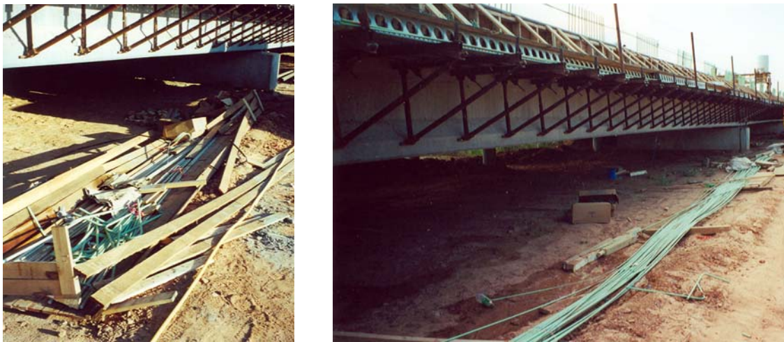
Figure 1. Improper storage of GFRP bars at construction site.

Improper handling of GFRP reinforcing bars can lead to surface damage, which can reduce the tensile capacity and durability of the bar. Results from this research project indicate that up to a 12% reduction in strength can occur after 50 weeks of exposure to simulated concrete pore solution (Trejo et al. 2003). Because of this, handling of the bars should be done in such a manner that surface damage is prevented. Deforming, heating, exposure to ultraviolet light, and other environmental exposure conditions (water, salt water, etc.) can change the material properties. As such, storage of the bars should be done to prevent exposure to these conditions. GFRP bars should be transported and stored in containers that protect the bars from property changing environmental exposure conditions. Figure 1 shows two scenarios where proper care was taken to transport the bars in wooden boxes, however, the storage conditions at the