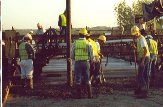
Figure 3. Consolidating concrete around GFRP bars.

Proper handling, transportation, site storage, and protection of GFRP bars should be practiced to prevent damage to the surface of GFRP bars. Such damage could result in reductions in strength and longer-term durability. When the surface of GFRP bars is visibly damaged replace these damaged bars with undamaged bars that are long enough to provide lap or development of the undamaged bars past the damage section.