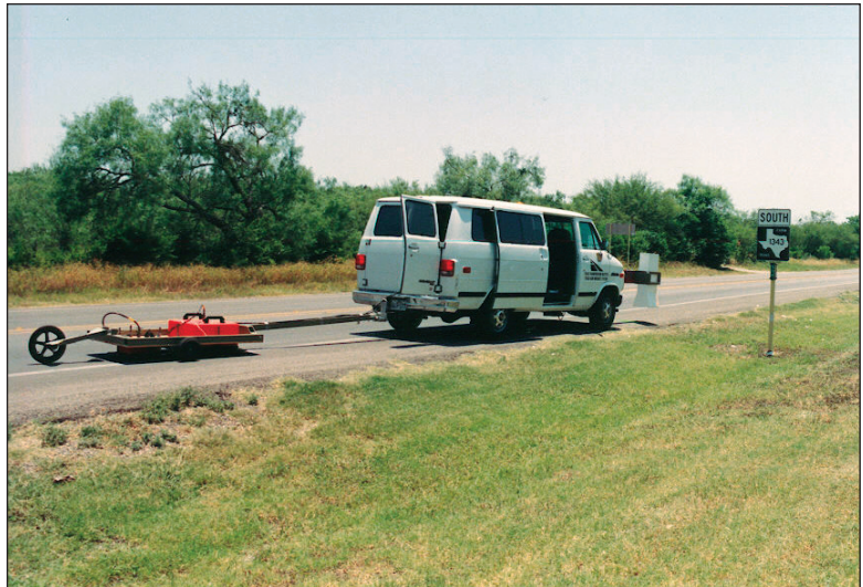
Figure 1. TTI's Combined Air-Launched and Ground-Coupled GPR Unit.

In the initial phase of the research, the Texas Transportation Institute (TTI) developed a field test