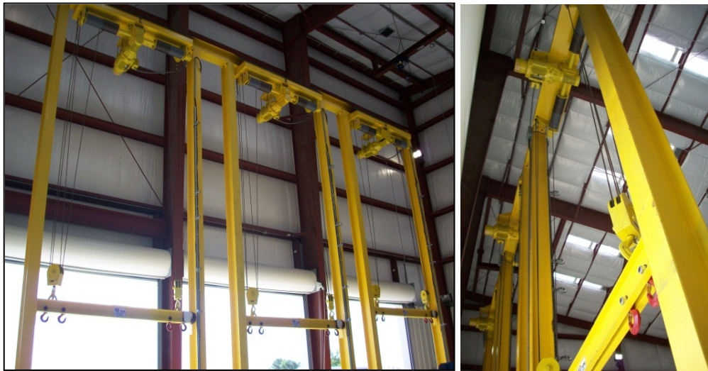
Figure 2. The 10-Ton Hoist System for Soil-Fill Test Beds.

A 1,500 sq. ft. covered preparation area connects the existing simulator and the new building. This area provides a covered space for preparation, storage, and connectivity. It also contains a fire suppression system.