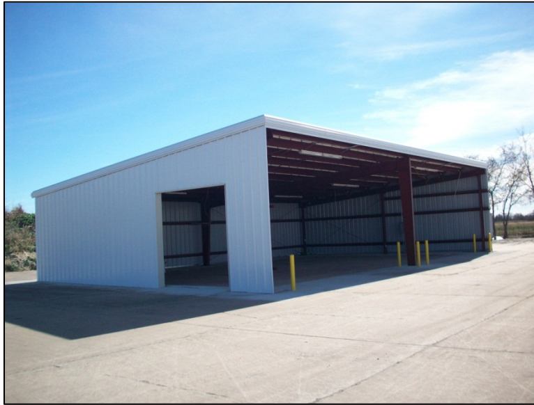
Figure 4. Soil Storage Building.

The relocation of the SRD flume was necessary to enable the construction of the new rainfall simulator. Demolition of the existing SRD flume occurred along with building/preparation area construction. The new SRD flume was relocated adjacent to the 2,800 sq. ft. climate-controlled greenhouse.