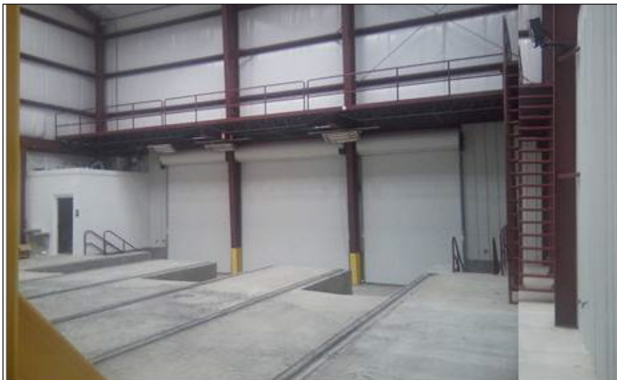
Figure 3. Mezzanine Level for Viewing.

A covered soil storage building was constructed to reduce the impact of weather on the moisture content of soils used for testing. This steel building provides a covered area for materials and allows for sediment bed preparation during inclement weather (see Figure 5).