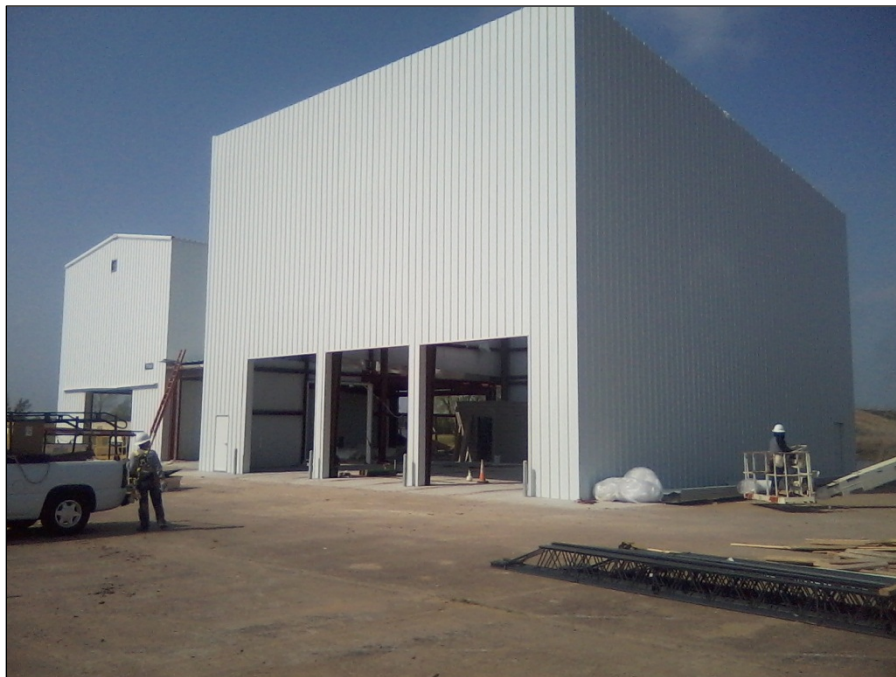
Figure 2. New Indoor Rainfall Simulator Building.

The building has six 14-ft. × 14-ft. roll-up doors: three at the building front to accommodate placement of the soil-fill test beds and three located at the rear of the building for retrieval of sediment collection system from the ramp entry at that the rear location. The rainfall simulator system consists of three independently operated rainfall racks that rise to accommodate any slope condition to maintain a 14-ft. above-bed height to ensure that the large raindrop distribution (approximately 4–6 mm) reaches 90 percent terminal velocity. Each rainfall simulator system has a motor that moves the racks to produce a random raindrop pattern to further simulate a natural, severe rainfall event. The rainfall simulators provide water drop size distribution and impact velocity that are typical of storms common to Texas and the Gulf Coast regions of the country. The rainfall simulators are designed to subject test beds to the greatest, most destructive rainfall characteristics and can generate up to 8 inches of rainfall per hour. In addition, the expansion facility design enables new performance evaluation capabilities for ASTM D6459-11 Standard Test Method for Determination of Rolled Erosion Control Product (RECP) Performance in Protecting Hillslopes from Rainfall-Induced Erosion.