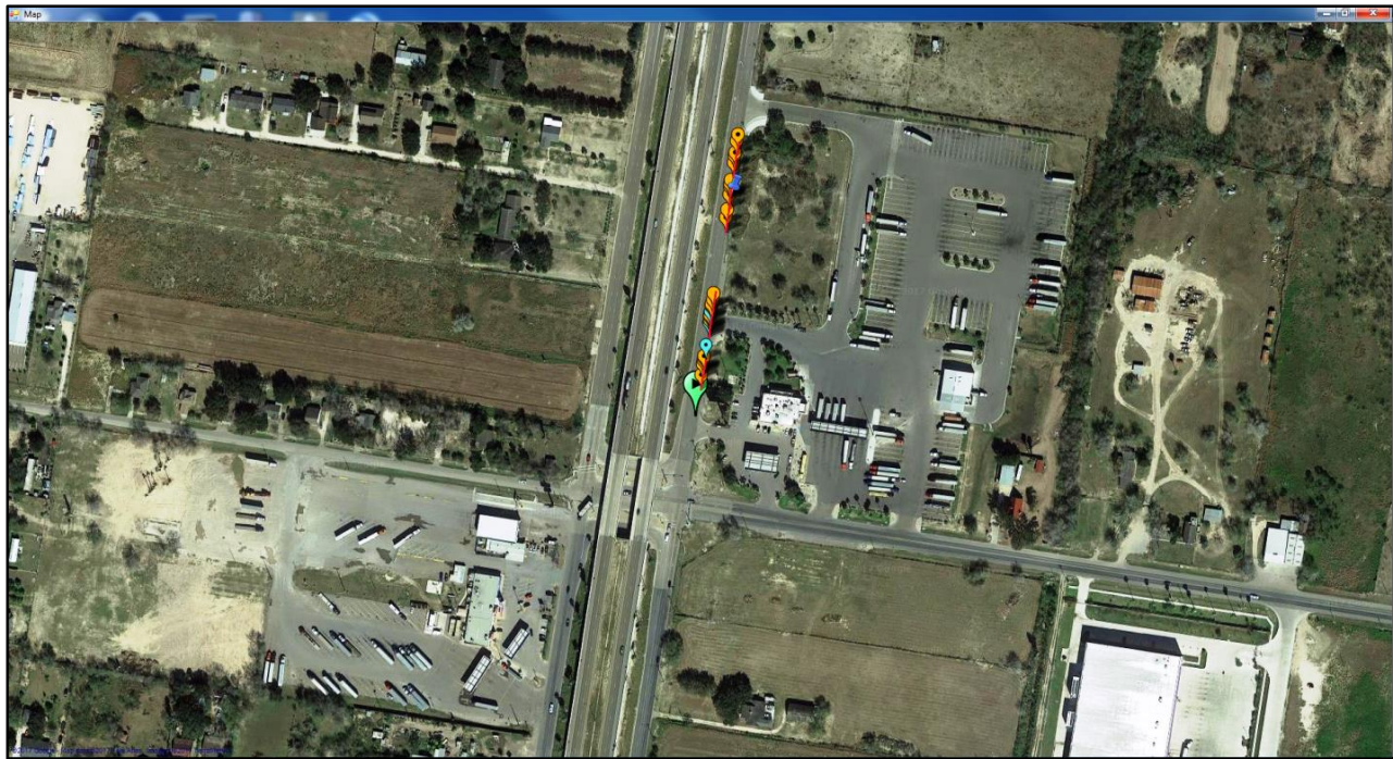
Figure 2. Illustration of Map Identifying Defects Needing Corrective Work.