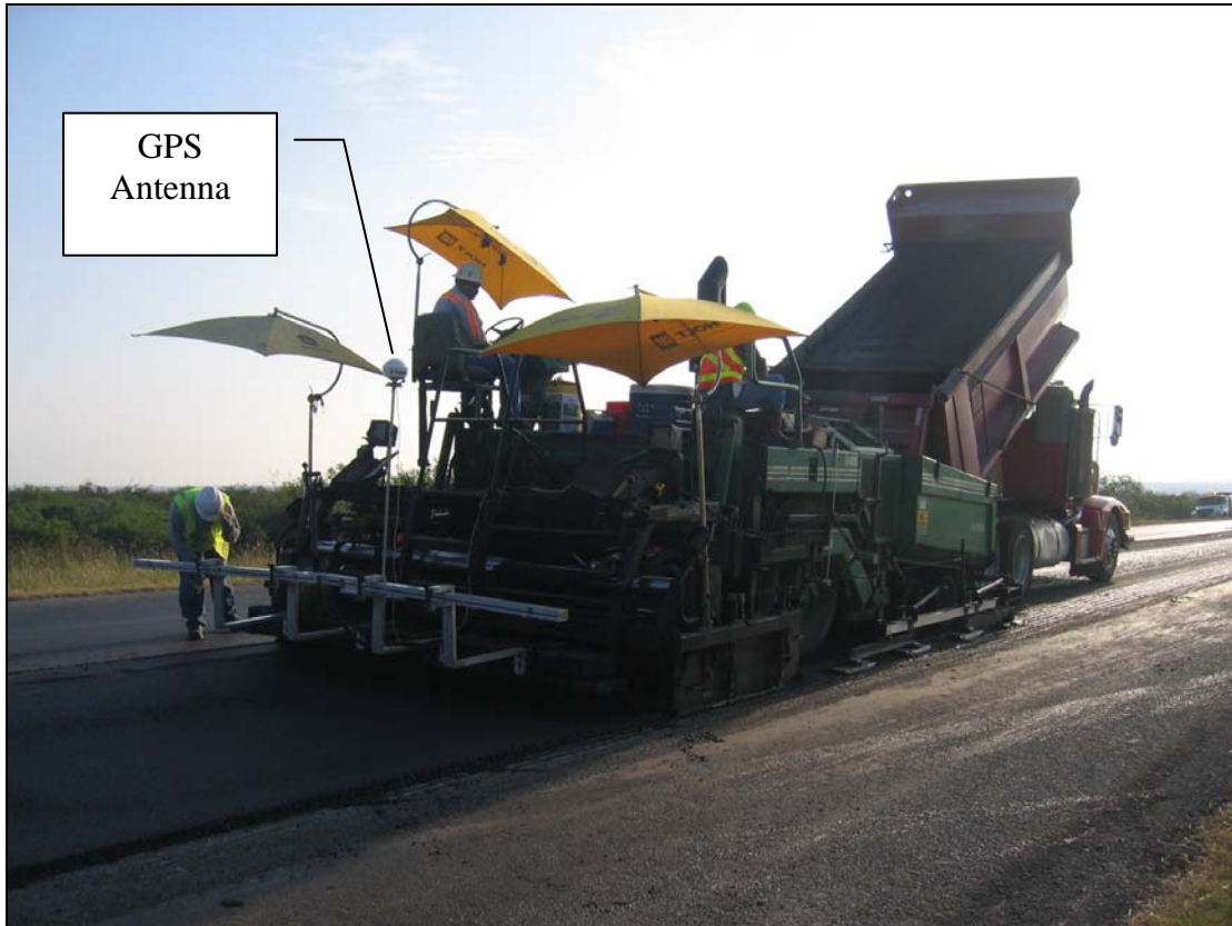
Figure 3. Pave-IR with GPS on Paver at US 90 Project.

A Pave-IR system retrofitted with GPS collected thermal plots during construction. Figure 3 shows the Pave-IR system with GPS installed on the paver. An antenna mount simply slips into holders on the infrared-bar mounts to secure the GPS antenna in place.