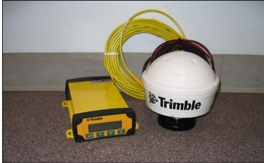
Figure 1. Trimble DSM232 System.