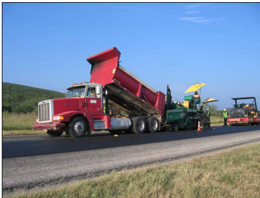
Figure 2. Paving CAM on US 90.

To collect the thermal profiles with GPS, TTI updated the Pave-IR collection software to include GPS functionality. Each time a scan of temperatures is recorded, the GPS coordinates are also recorded. On September 23, 2008, TTI researchers collected thermal data on a crack-attenuating mix (CAM) paving project in the San Antonio District. The project site was on US 90 just west of Uvalde. A Barber Green® BG-260C paver was used to place the mix, which was produced in Uvalde approximately 15 miles away. End-dump trucks transported the mix and off-loaded the CAM directly into the paver hopper as Figure 2 illustrates.