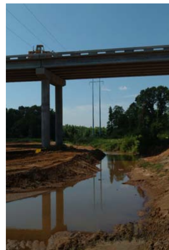
Figure 5. Loop 49 Construction.