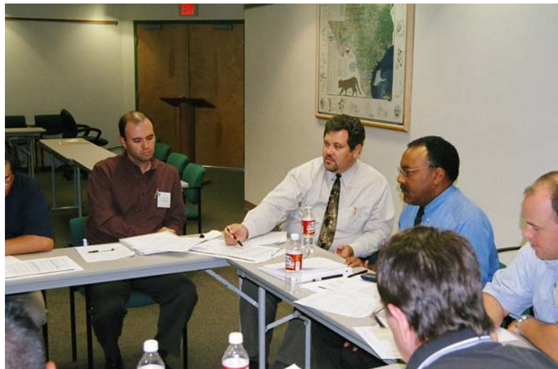
Figure 6. Loop 49 Case Study Workshop.

Participants in the workshop receive a notebook that includes the workshop presentation and printed diagrams, charts and artist renderings discussed during the presentation. In addition, each receives a CD that contains over 30 files that can be reviewed and adapted for their own projects, including survey instruments, presentations, photos, environmental documents, RMA documents, a planning timeline, a financial planning template and research documents.