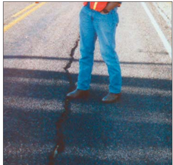
Figure 2. Longitudinal Cracking Problems.