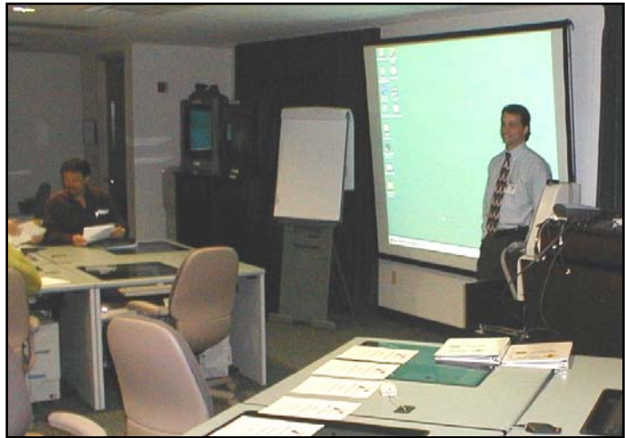
Figure 1. TTI Researchers Served as Instructors.

All of the courses were designed using adult-learning principles with emphasis on student interaction, in-class hands-on exercises, and extensive classroom discussions. The courses were taught by TTI researchers (Figure 1) at TxDOT training facilities throughout the state including Abilene, El Paso, Fort Worth, Austin, Atlanta, and others. Additionally, many of the courses were featured at TxDOT's