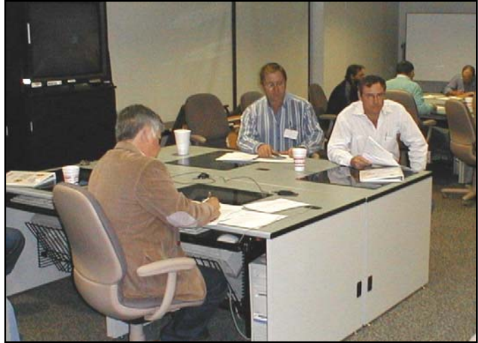
Figure 3. Courses Were Held at TxDOT Training Facilities.

TTI instructors conducted 39 workshops during the length of the project. In order to minimize travel for participants, all of the workshops were held at TxDOT's state-of-the-art training facilities at district offices throughout the state (Figure 3). Table 1 lists all of the deliveries, their locations, and the number of attendees for each workshop. In total, approximately 700 participants attended the TRICOM workshops. While the vast majority of the participants were TxDOT employees, it should be noted that numerous attendees came from local governments, metropolitan planning organizations, and private consulting firms.