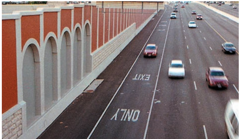
The San Antonio-Bexar County area served as the basis for model testing.

The general approach was to utilize the 1970 computerized network and traffic analysis zone population, household, income, and employment data, checked for consistency with the 1970 census data, in conjunction with the 1969 origin-destination survey to calibrate a new 1970 travel demand model. This combination would result in a 1970 model calibrated with current state-of-the-practice procedures that would be used to forecast 1980 and 1990 travel