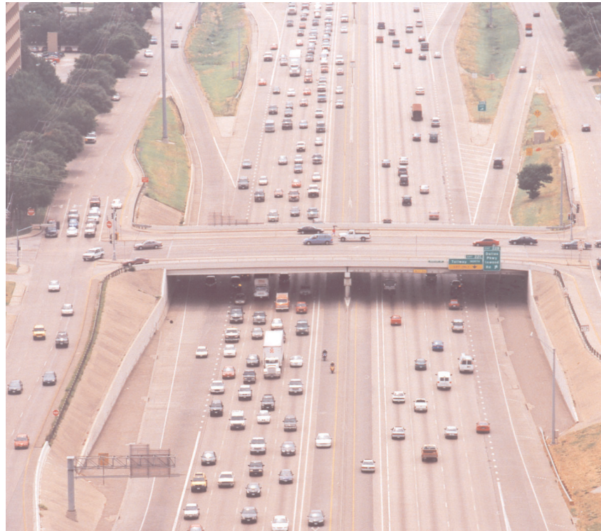
Figure 2. Limited access concurrent flow lanes along I635 (LBJ Freeway) in Dallas, Texas

Additionally, this synthesis of guidelines was outlined for inclusion in the on-line version of TxDOT's Roadway Design Manual . This new section of the Design Manual will focus on design aspects of managed lane facilities, and the topics will be linked to various aspects of managed lane development as presented in Report 4161-1.