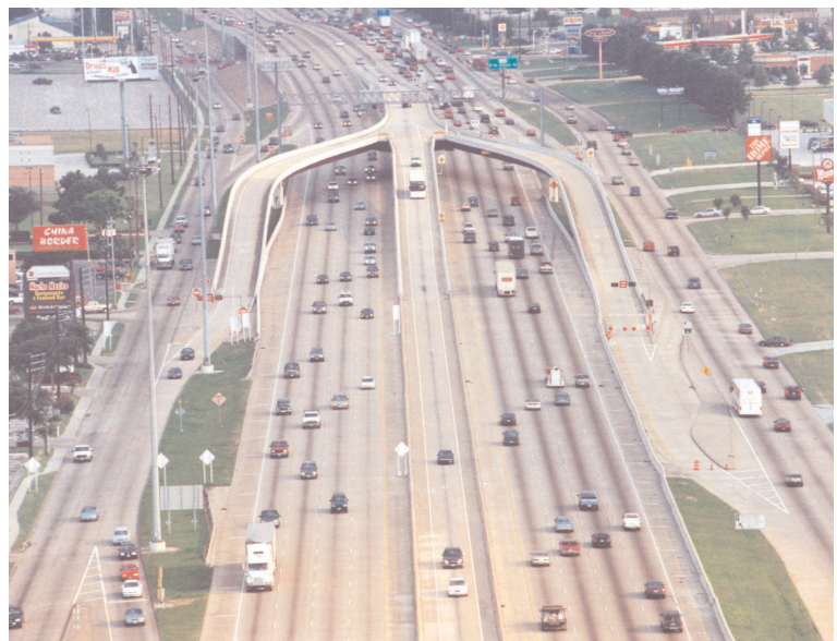
Figure 1. Flyover access ramp to barrier-separated reversible HOV facility on I45 (North Freeway) in Houston, Texas

Researchers drew from the experiences of leading states in the development of HOV and managed lanes throughout the country to develop a synthesis of guidelines. This information is summarized in TxDOT Report 4161-1: “Preliminary Guidance for Planning, Operating, and Designing Managed Lane Facilities in Texas.” Photographs and schematics are included